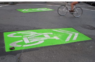
* SHARROW Marking